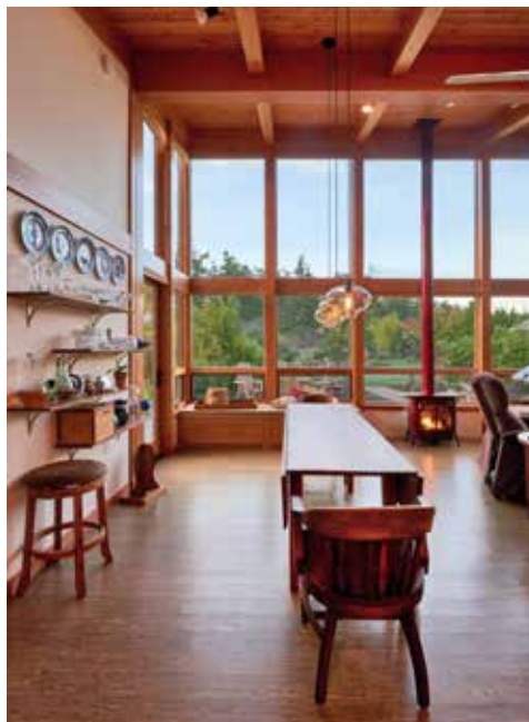
(above left) EXCELLENCE IN AFFORDABLE HOUSING DESIGN Lakeside Senior Apartments David Baker Architects