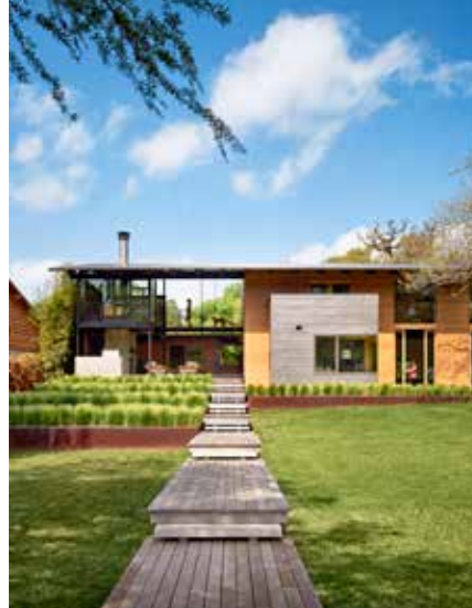
(above left) ONE- AND TWO-FAMILY CUSTOM RESIDENCES Hog Pen Creek Retreat Lake|Flato Architects

The Specialized Housing award recognizes outstanding design of housing that meets the unique needs of other specialized housing types such as single room occupancy residences (SROs), independent living for the disabled, residential rehabilitation programs, domestic violence shelters, residential halls/student housing, and other special housing.