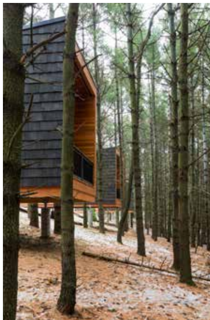
(left) SPECIALIZED HOUSING Whitetail Woods Regional Park Camper Cabins HGA Architects and Engineers