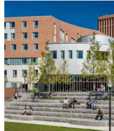
(below left) MULTIFAMILY HOUSING 1180 Fourth Street Mithun initiated as WRT/Solomon ETC