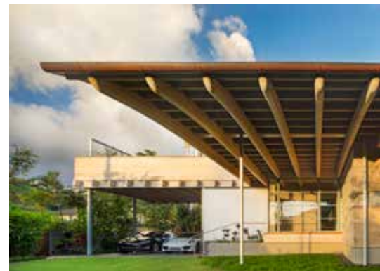
(above left) ONE- AND TWO-FAMILY CUSTOM RESIDENCES Independence Pass Residence Bohlin Cywinski Jackson